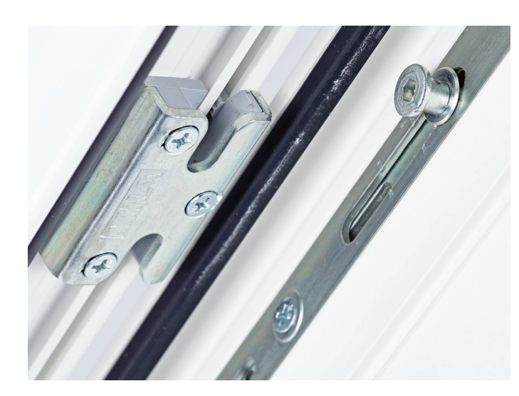
High security locking as standard