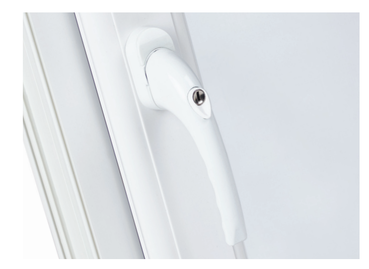
Suited window furniture available