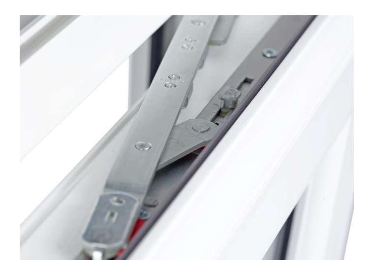
Anti-blowback device automatically engages when in tilt position