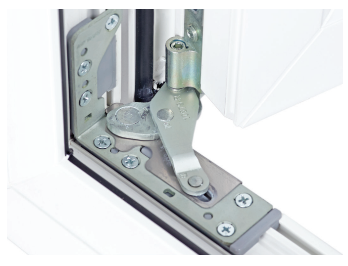
Easy to assemble corner hinges and adjustment point