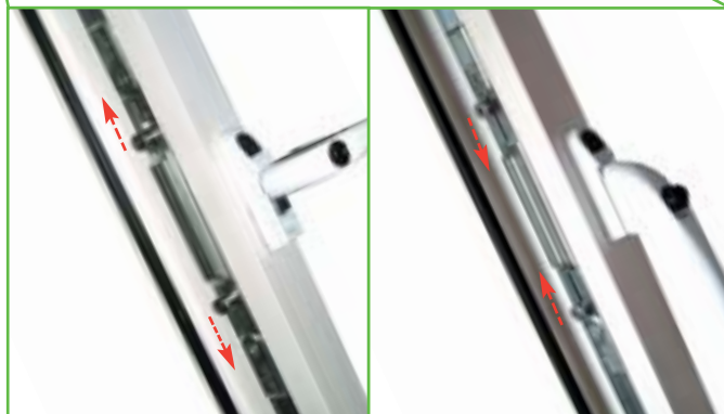
Central mushroom cams throw in opposing directions