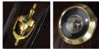
Door Knockers Viewer