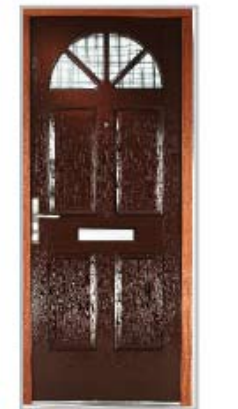
FireFree Fire Door

to place your order simply call Fear Free doors on 0808 100 8881